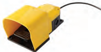
Optional foot switch with protective cover