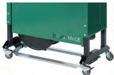
Optional second foot pedal for operation on both sides