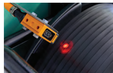
Low strap warning facility

The SBM 2330 is a high performance, fully automatic strapping machine that can be integrated within existing conveyors in packaging or production lines due to its adjustable integral conveyor and four locking castors. It offers a variety of strap programs to suit different packages, all selected using the simple touch panel and graphic display.