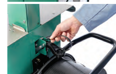
Simple and rapid coil changes