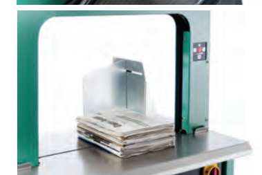
Optional bundle stacking/squaring jig for precise positioning of loose loads