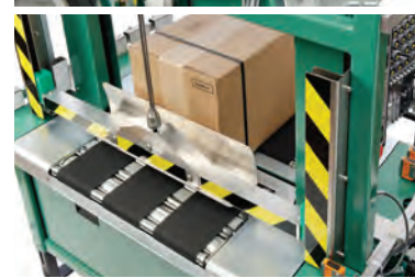
Optional bundle stop for precise positioning of loose loads