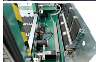
Easy access for service without tools