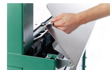
Easy access for maintenance without tools

The SBM 2300 manually operated model is the ideal solution for larger packages. It delivers strap tensions of up to 300N, at up to 70 cycles a minute and is available in a range of chute sizes to suit differing package dimensions.